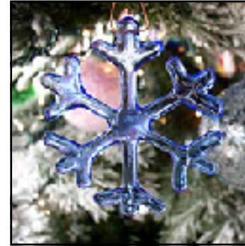
Uses Light Blue Waterglass Glass Stock # S132W