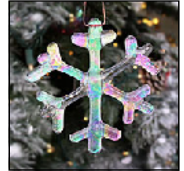
Uses Clear Hi-Fire Iridescent System 96 Glass Stock # SI-100SFS